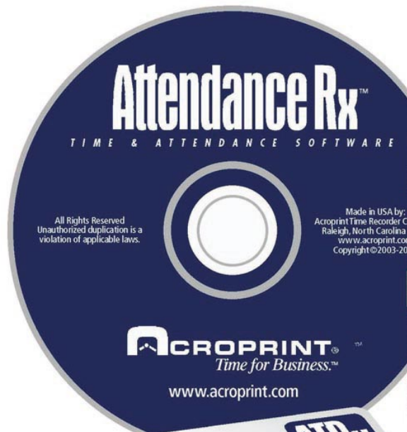
EXPORT DATA TO PAYROLL