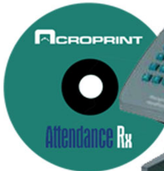
EXPORT DATA TO PAYROLL